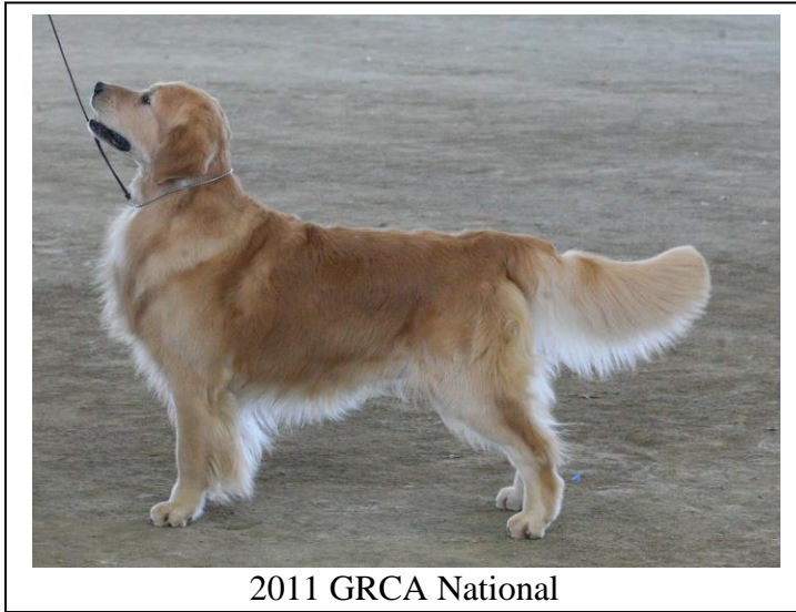
2011 GRCA National